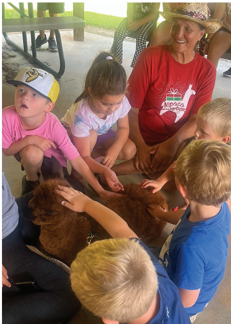
Critter Therapy with Ally's Adventures.

Most of my petting zoo "kids" are miniature and several have been bottled raised also I have been gifted several and they all have names and know their keeper. I have miniature goats, mini jersey