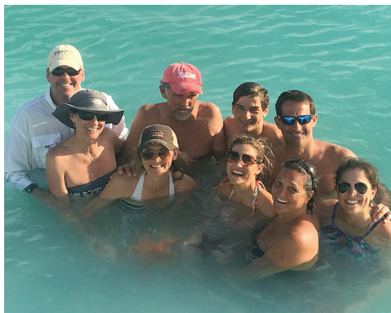
Family trip to the Turks & Caicos Islands with Ally's daddy

BOOM!: What is it about living in the River Region that you like? What do we need more of?