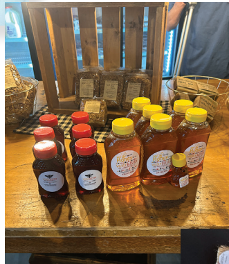
Wildly Blessed Products

My favorite get away spot is the mountains in North Carolina, where we have a cool, primitive horse camp right on the creek, no power, no phone service, very relaxing and a lot of nature. We try to visit at least two times a year, spring, and fall. My closest friends who are like family and my family are always up for a trip somewhere fun. Some of my favorite travel experiences are the yearly beach trips that we take as a family. I loved traveling with my parents before they went to Heaven, Mama in 2015 and Daddy in 2018. The two trips that are among my favorites are from 2016 when most of our family traveled to Turks &