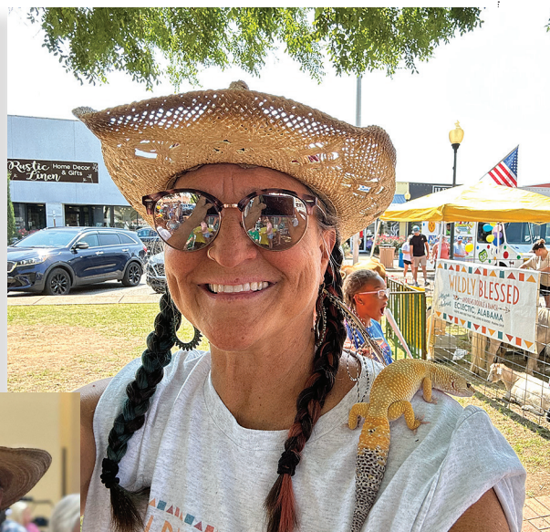
Ally's Adventures, Petting Zoo