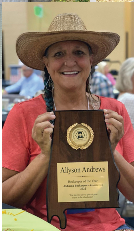
Alabama Beekeeper of the Year

BOOM!: Please give us a brief biography, i.e., where you're from, education, what brought you to the Montgomery area, did you raise your family here, schools, family, etc.?