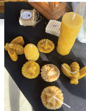
Wildly Blessed Products

Caicos. It was an amazing trip and one of the last big ones I was able to travel with my Daddy.